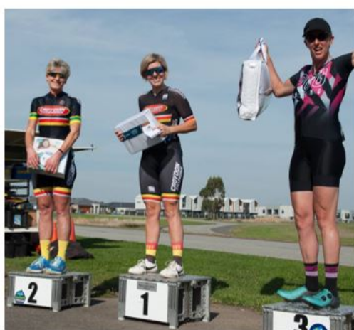
Winners are Grinners KP from 2005 to 2021