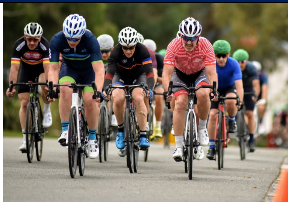
AB Combine.