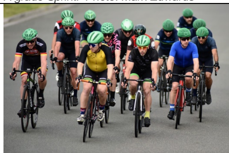
B grade behaving...briefly.