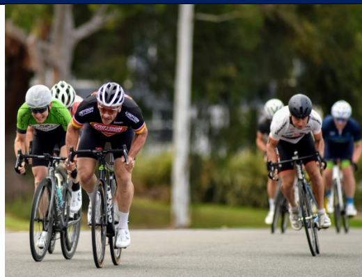
A grade Sprint.