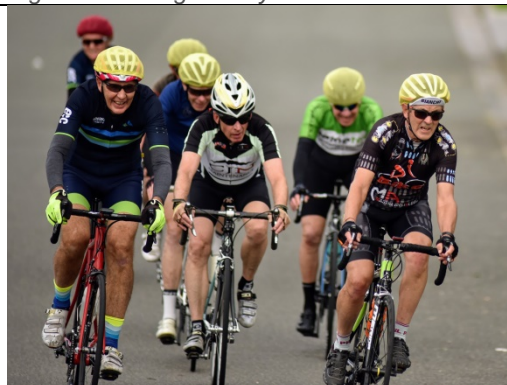
D grade tension.