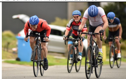
C grade sprint.