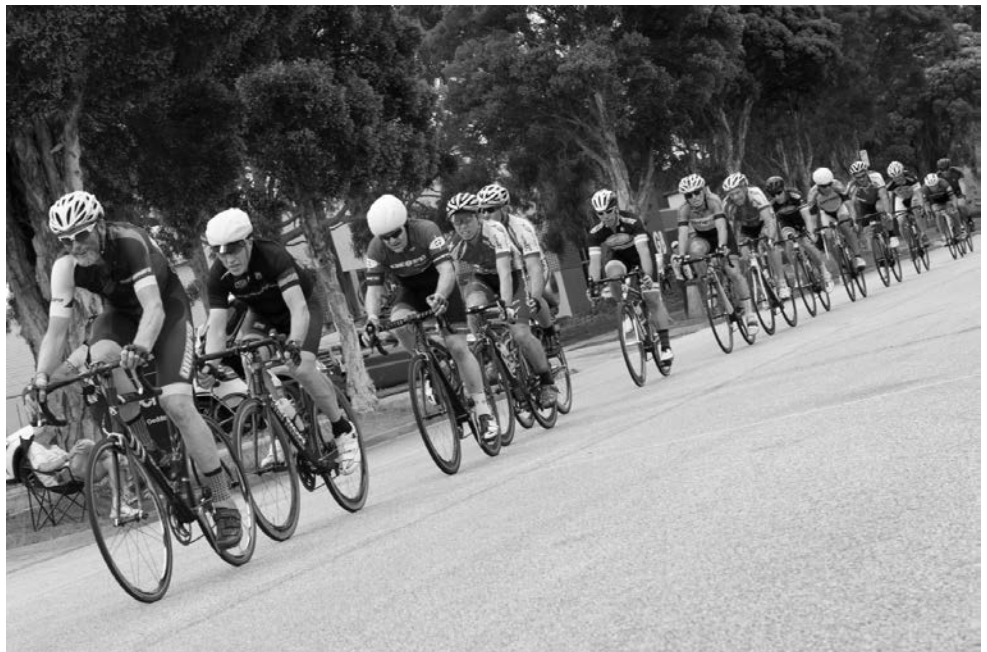
Line up for Dunlop Road this Saturday (Photo: Pete Morris, 2017 Dunlop Charity Day)

Next week the crits continue with graded scratch races at Dunlop Road. Racing begins for grades B,D and F at 1:30 pm and 3:00 pm for grades A, C and E.