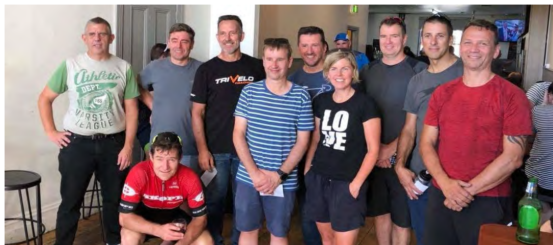
Flashback! This photo of (most of) the place-getters from Garfield emerged during the week.