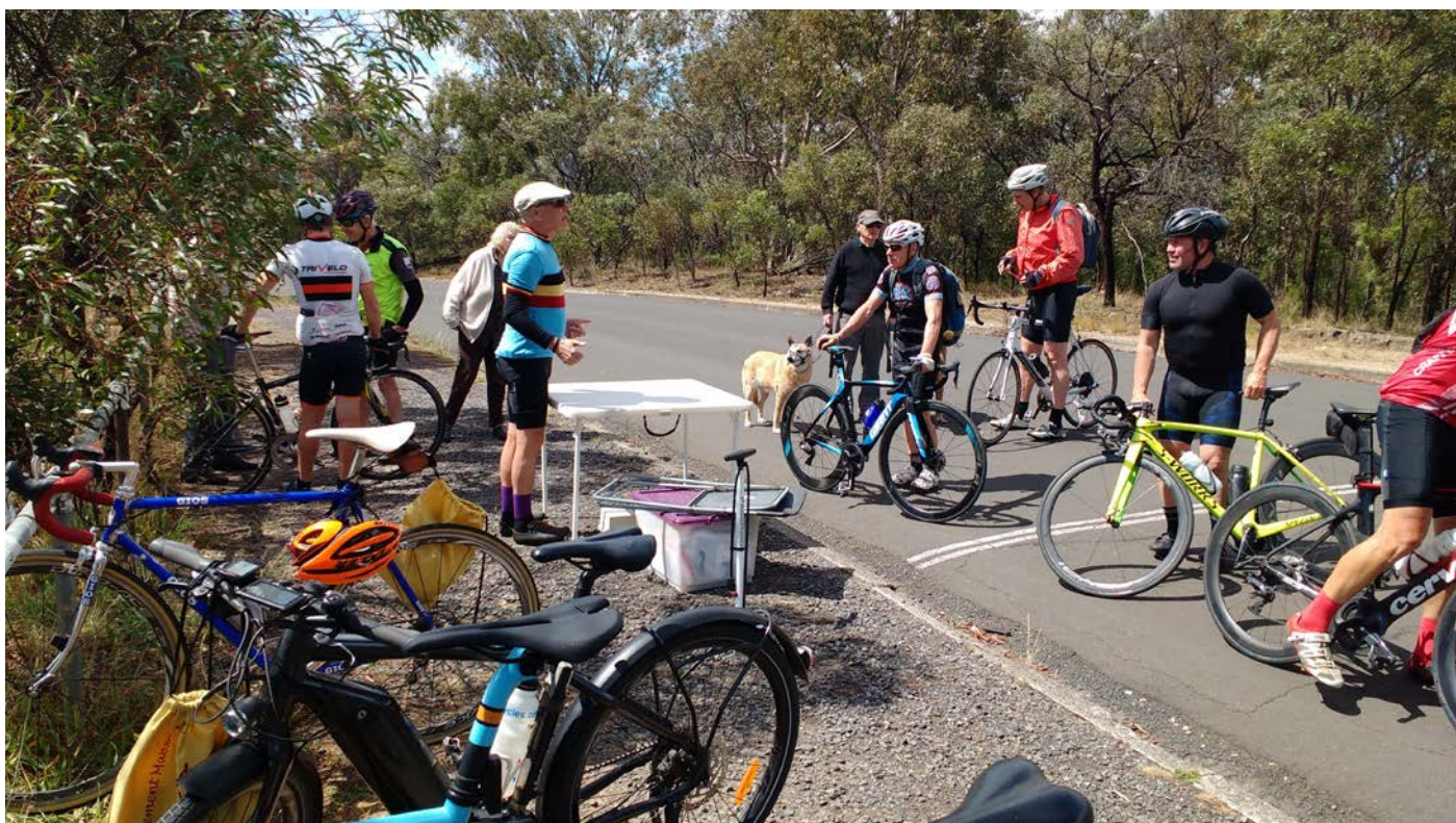
Post mortems at the Loop on Wednesday. The drover's dog didn't win.