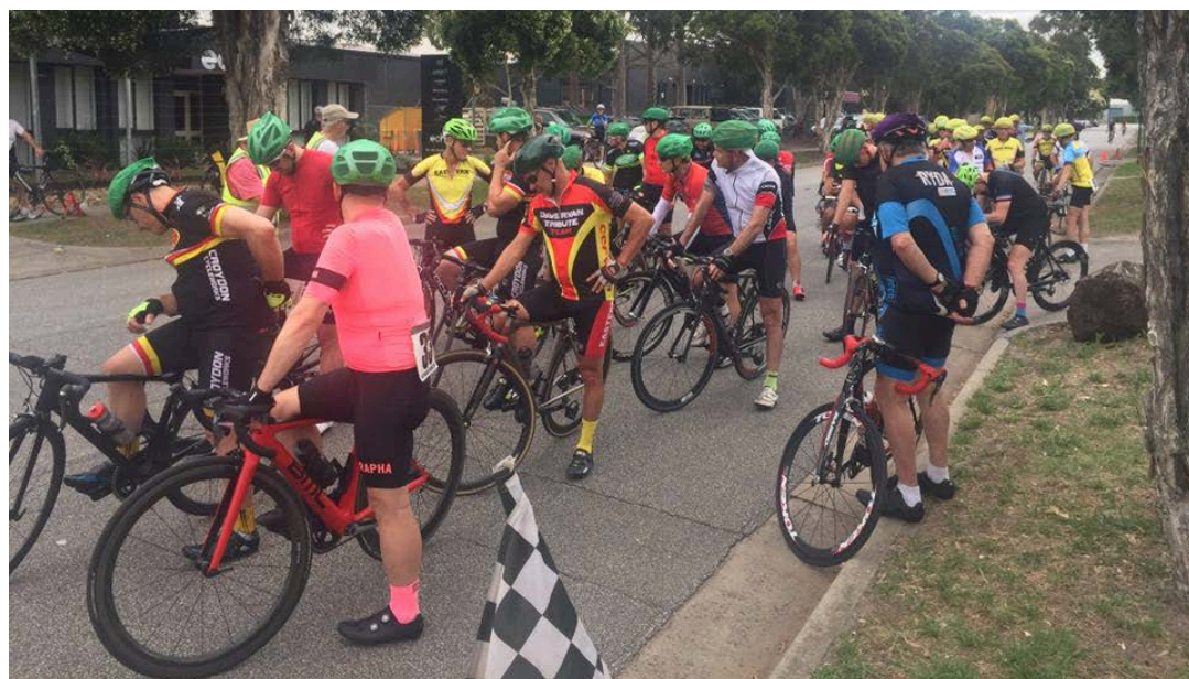
Big fields dominated by Eastern riders were the order of the day for the Dave Ryan Memorial crits at Dunlop Road, and none was bigger than B Grade.

In other news, it's membership renewal time of year. AVCC licences expire at the end of December, so go to the membership page of the club website at easterncycling.com/membership , click the 'Renew' button and follow the instructions to be covered by insurance etc. for racing and training in 2019.