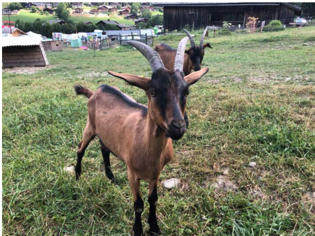
Mountain goats, come race at Gruyere!

We face an uphill battle in more ways than one when the Tour de Metro (Eastern vs Northern) resumes at Gruyere on Saturday. Northern leads the series by 124 points to 83 at the halfway point. It's still up for grabs, but we need a big effort – and the first step is to be there on the start line in force. Racing starts at 2 pm and the registration desk (on Killara Road, outside the footy oval) will close at 1.45 pm sharp. Don't forget your tail light! See also 'Social notes' in News etc. later in this newsletter.