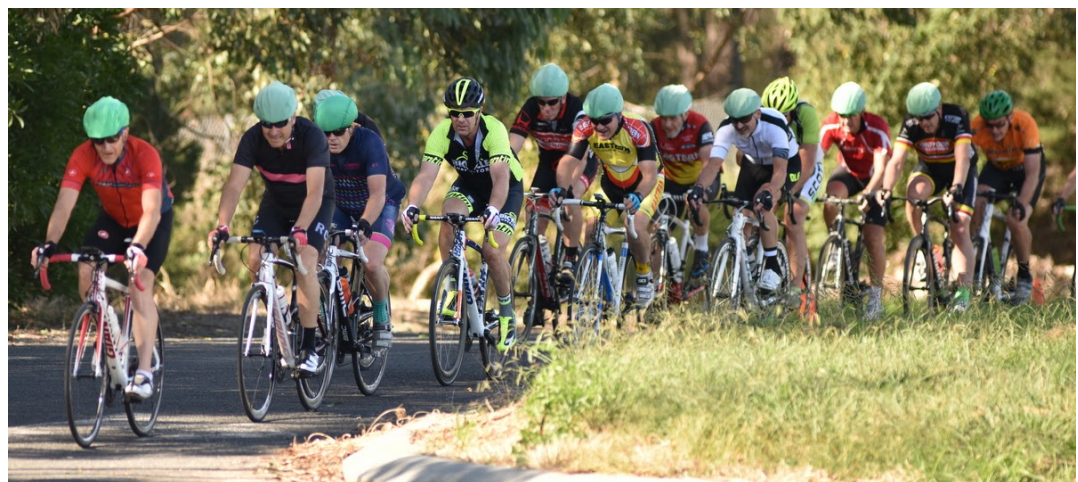
B Grade was the biggest bunch on Saturday.

The Spring Classics are not even finished yet, but it's time to put the Club's Tour de France night in your diary. Saturday 22 July is the date, the Kilsyth Club is the place, and there's a great program taking shape. More details in due course.